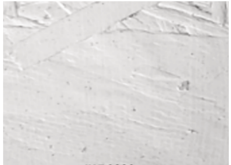
ASTM D3273 ANTI-MICROBIAL TEST RESULTS (4 WEEKS)