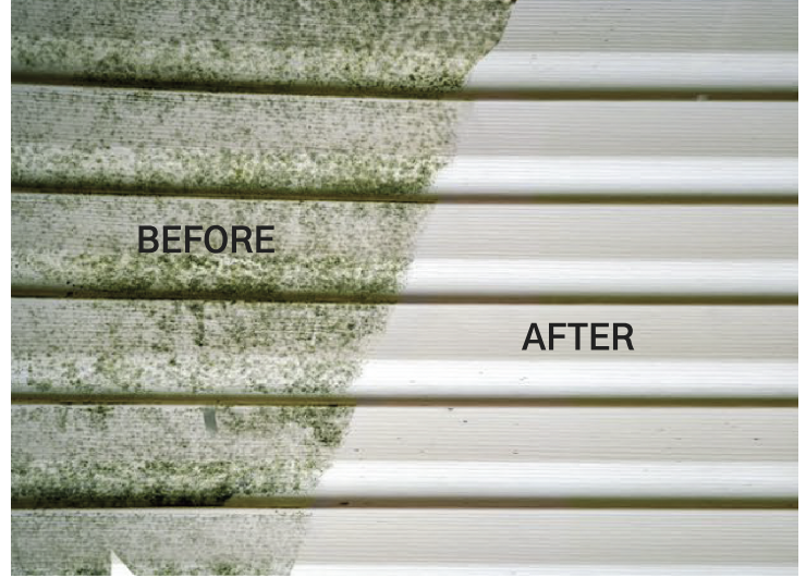
HEAD TO HEAR LABORATORY DRAWDOWN TEST