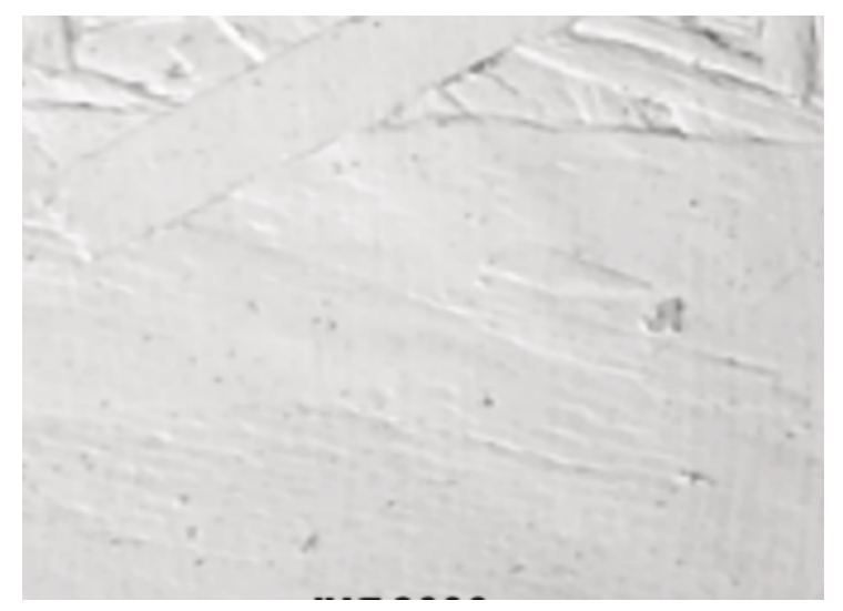
ASTM D3273 ANTI-MICROBIAL TEST RESULTS (4 WEEKS)